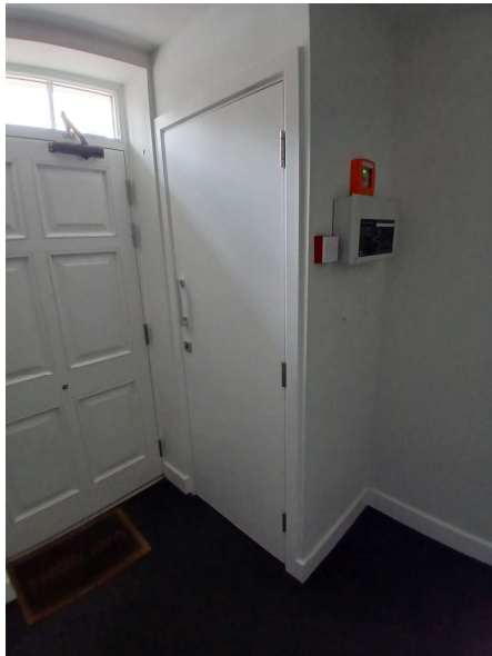
Cupboard Doors (Electrical Cupboard Doors)