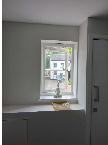
Windows (Communal Windows)