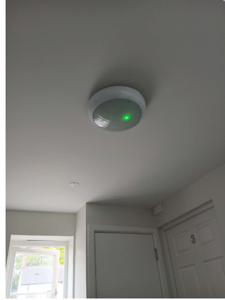
Lighting (Standard and Emergency Lights)